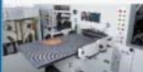
Control system with LED screen display at platen station