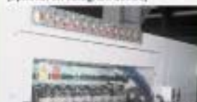
Foil break photo sensors (optional on hologram device)