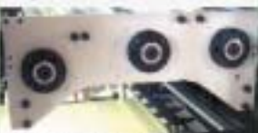
Servo motor driven programmable foil puller